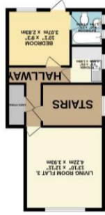
GROUND FLOOR (145.9 sq. ft. / 13.4 sq. m.) approx.