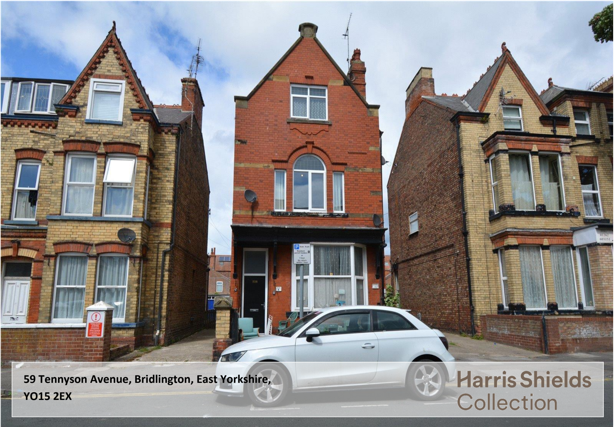
59 Tennyson Avenue, Bridlington, East Yorkshire, YO15 2EX